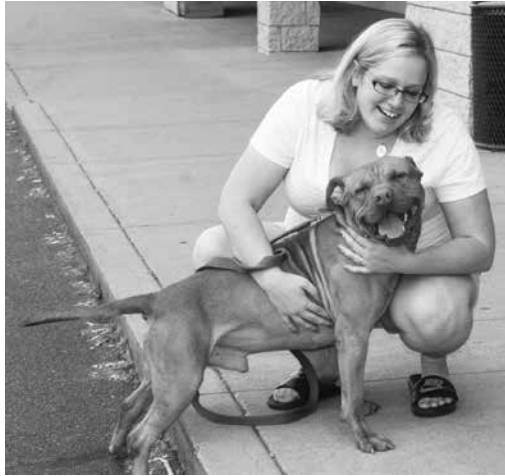
"Casey and Odie"